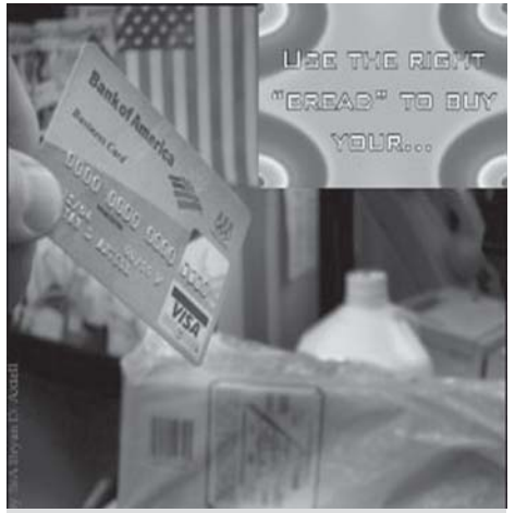
Make sure your government travel card is used only for travel expenses and only when you are TDY. Remember, there is no such thing as "paying it off before they notice." Protect your career, protect your card.

"I'll keep extending (my term of service) until I'm a very old man," Ali said with a huge smile through the hospital interpreter.